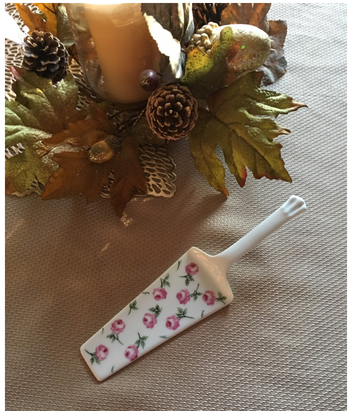
Another option for painting chintz is "chintz roses."